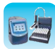
Total Organic Carbon 3800